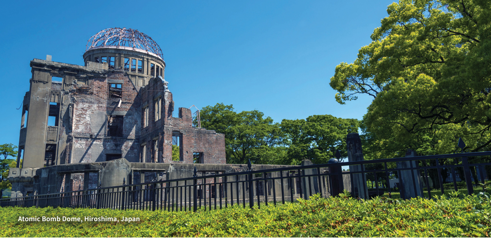
Atomic Bomb Dome, Hiroshima, Japan