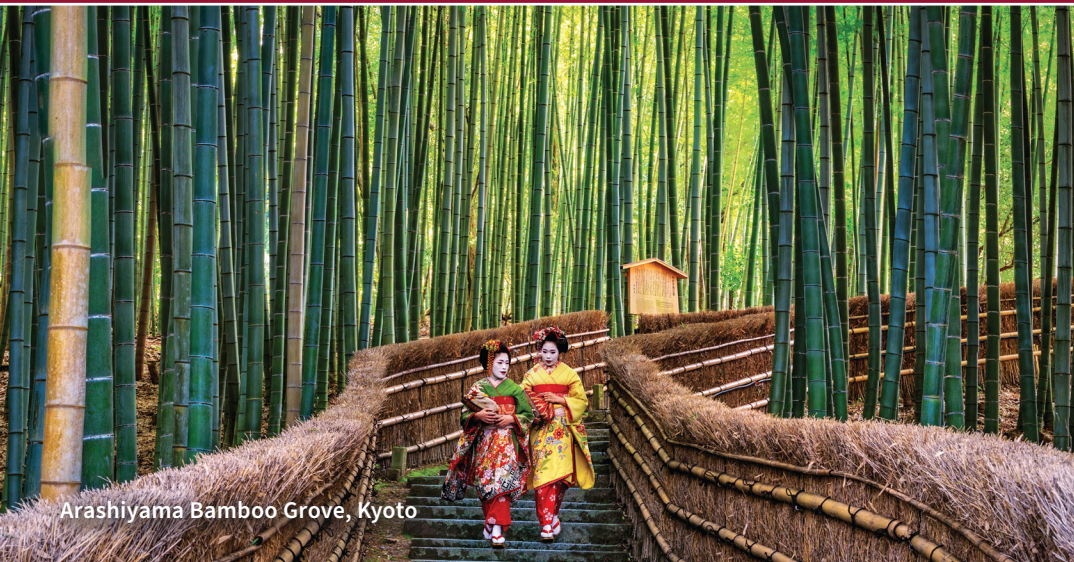
Arashiyama Bamboo Grove, Kyoto