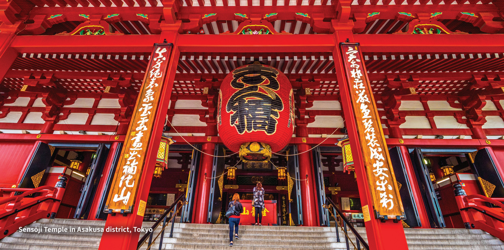
Sensoji Temple in Asakusa district, Tokyo