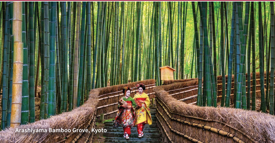
Arashiyama Bamboo Grove, Kyoto